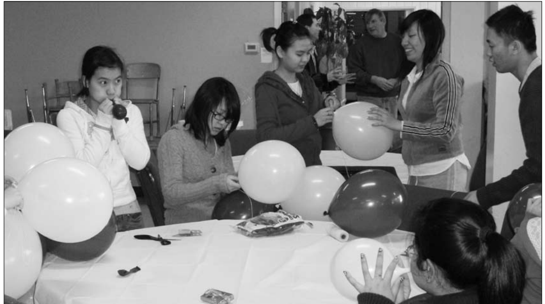
Students preparing for the thanksgiving dinner.

This year was my second Thanksgiving in the US but the first time in Washington State. The first Thanksgiving I held with my host family last year. Unlike the first one, the Thanksgiving this year I was celebrating with the International Student Program of Highline community college. It was held at a church for all international students who don't have plans for Thanksgiving. I really enjoyed that day with many fun activities.