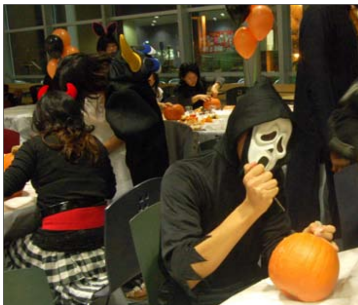
Student dress up for the pumpkin carving party in HSU.

As soon as I started carving, I realized that carving pumpkins was actually a very