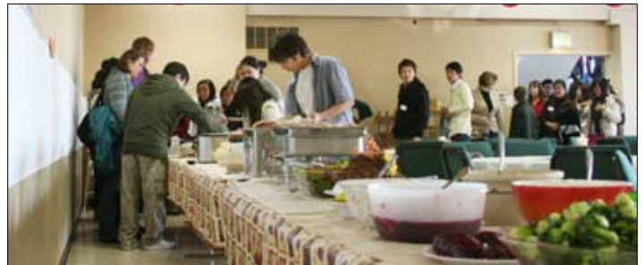
Students light up their jack-o'-lanterns in front of the HSU. (Top) Volunteers bank visit nursing home in Seattle.(upper left) Thanksgiving buffet.(upper right) Students present Thanksgiving skit in the Des Moines church.(lower left) Students on their Ice skating trip.(lower right)